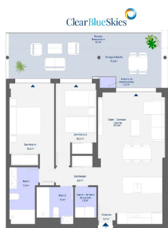
Residencial Abora Bis 2 Planta 2ª Letra C 2 Dormitorios